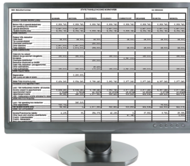
This time-saving State Taxable Income Workpaper summarizes state calculations and provides an easy-to-follow audit trail, starting with federal income and ending with state tax due.